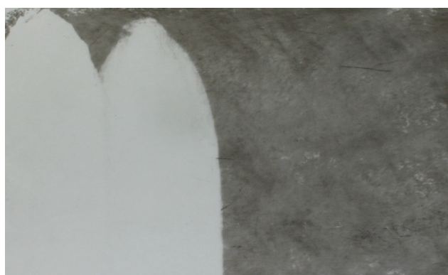
Dilution 1:20 Dilution 1:40 Berol R648 NG