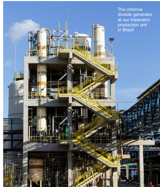
The chlorine dioxide generator at our Imperatriz production unit in Brazil